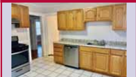
71 Seymour St. #3 Roslindale • $2700 a month Updated & Freshly painted 5 Rm 2 bed unit. Hardwood Floors – Front & Back Porches.