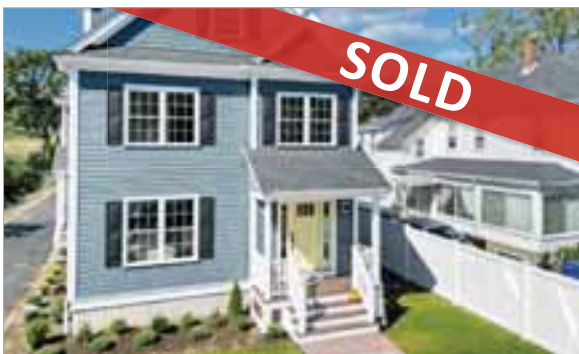
107R READVILLE STREET U:107R HYDE PARK

SINGLE FAMILY 5 beds; 3 full baths Listed by Michael McGuire $1,395,000