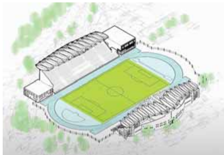
A rendering of the proposed plans for the stadium as it is currently designed.