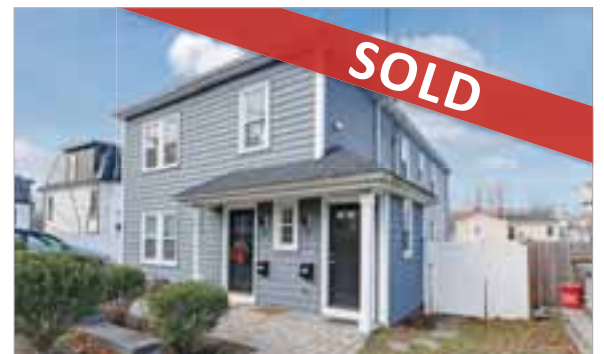
17-19 TAFT STREET QUINCY

MULTI FAMILY 7 beds; 3 full baths Listed by Michael Hunt $849,000