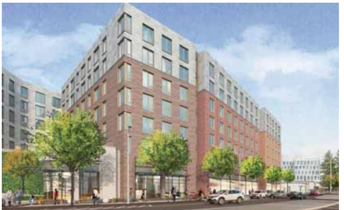
Residents said they don't want Barry's Corner and all of Western Avenue to turn into a "canyon" over in Lower Allston.