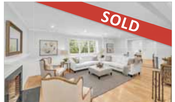
22 VFW PARKWAY WEST ROXBURY

SINGLE FAMILY 3 beds; 1 full, 1 half baths Listed by Mary Forde $750,000