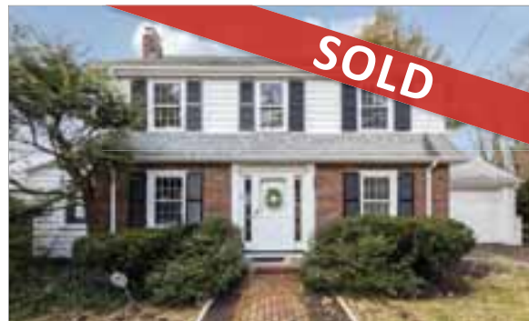
39 LINNET STREET WEST ROXBURY

SINGLE FAMILY 4 beds; 2 full baths Listed by Pat Tierney $649,900