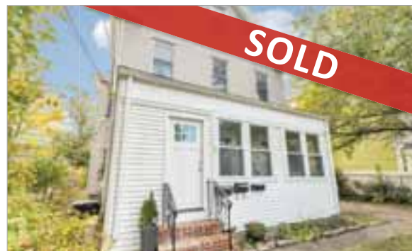
29 PIERCE STREET HYDE PARK

CONDO 4 beds; 2 full, 1 half baths Listed by Kris MacDonald $799,000