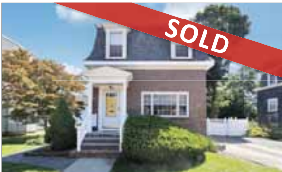
1036 RIVER STREET HYDE PARK

YOUR EXPERT REAL ESTATE TEAM FOR BUYING OR SELLING IN AND AROUND THE BOSTON AREA!