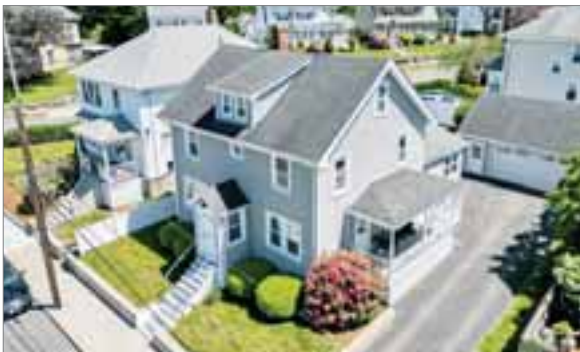
8 ALARIC STREET WEST ROXBURY

YOUR EXPERT REAL ESTATE TEAM FOR BUYING OR SELLING IN AND AROUND THE BOSTON AREA!