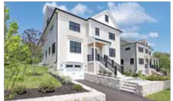
5 STARLING STREET WEST ROXBURY

SINGLE FAMILY 3 beds; 3 full, 1 half baths $1,549,000 Listed by Mary Forde