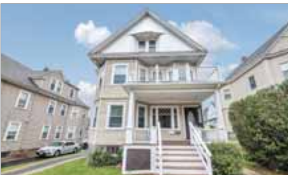
36 LORRAINE STREET U:1 ROSLINDALE

SINGLE FAMILY 4 beds; 2 full, 1 half baths $1,650,000 Listed by Rosemar Realty Group