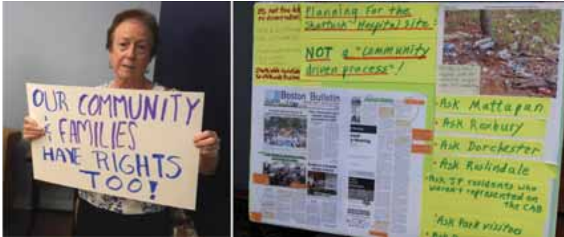
The opposition to the BMC vision was waged with signs by patrons of the meeting.