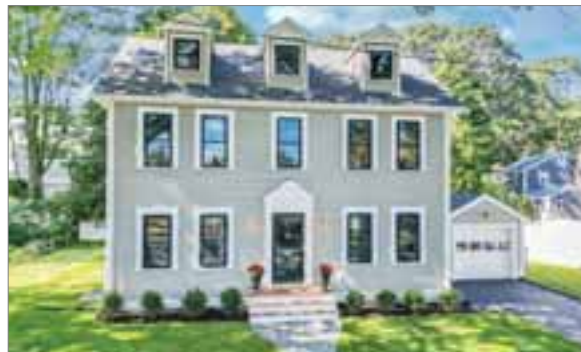
12 PRESIDENT ROAD WEST ROXBURY

SINGLE FAMILY 4 beds; 2 full baths $839,900 Listed by The Ultan & Caitlyn Team