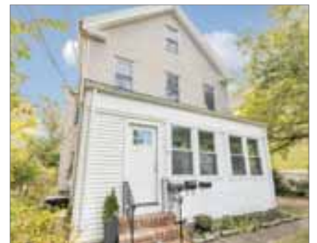
29 PIERCE STREET HYDE PARK

TOWNHOUSE 4 beds; 2 full, 1 half baths $849,000 Listed by Kris MacDonald