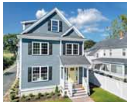
107 READVILLE STREET, U:107 HYDE PARK

CONDO 2 bed; 1 full, 1 half baths $825,000 Listed by Kris MacDonald