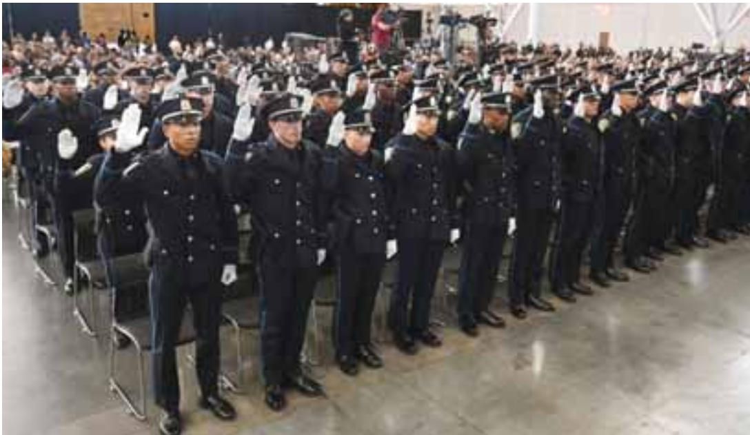
Over 60 percent of graduates are people of color. Recruit class is the first to receive language access training during academy