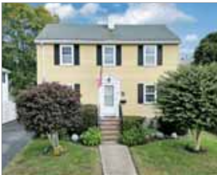
21 DANNY ROAD HYDE PARK

YOUR EXPERT REAL ESTATE TEAM FOR BUYING OR SELLING IN AND AROUND THE BOSTON AREA!