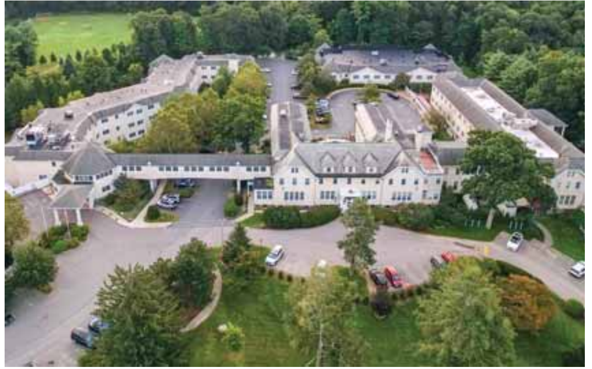
The German Center will be undergoing renovations this winter to offer more services for residents with memory-related conditions.