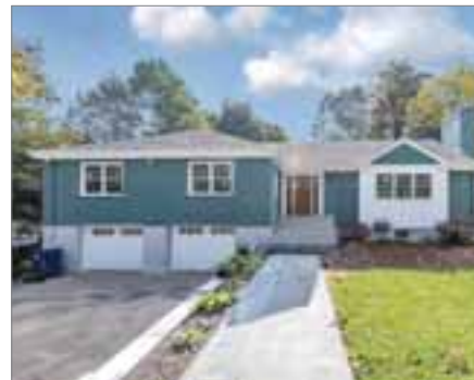
22 VFW PARKWAY WEST ROXBURY

SINGLE FAMILY 4 beds; 3 full, 1 half baths $1,425,000 Listed by Mary Forde