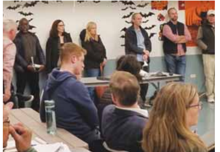
Residents spoke against the project during the WRNC meeting, but the vote was split among the council members.