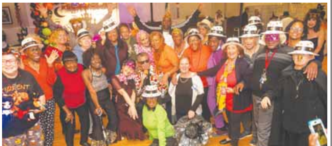
More than 100 seniors gathered at the Irish Social Club in West Roxbury recently for the AgeStrong Commission annual Senior Halloween party.