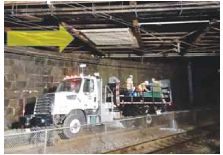
Work is progressing on the bridge project, if a bit slower than residents would probably like.

Past traffic patterns are still in place and cyclists and pedestrians will still be able to use the bridge. MassDOT reported it has completed about 10 percent of the work removing the deck pans,