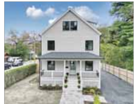
275 PARK STREET WEST ROXBURY

SINGLE FAMILY 5 beds; 3 full baths $1,495,000 Listed by Michael McGuire