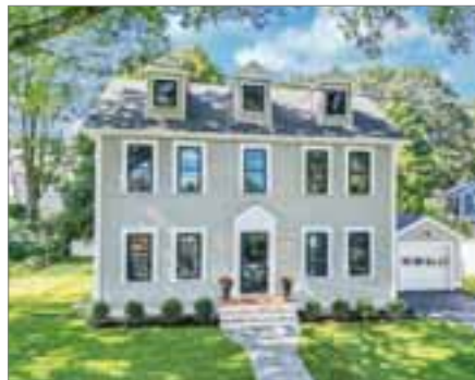
12 PRESIDENT ROAD WEST ROXBURY

SINGLE FAMILY 3 beds; 1 full, 1 half baths $674,900 Listed by Pat Tierney