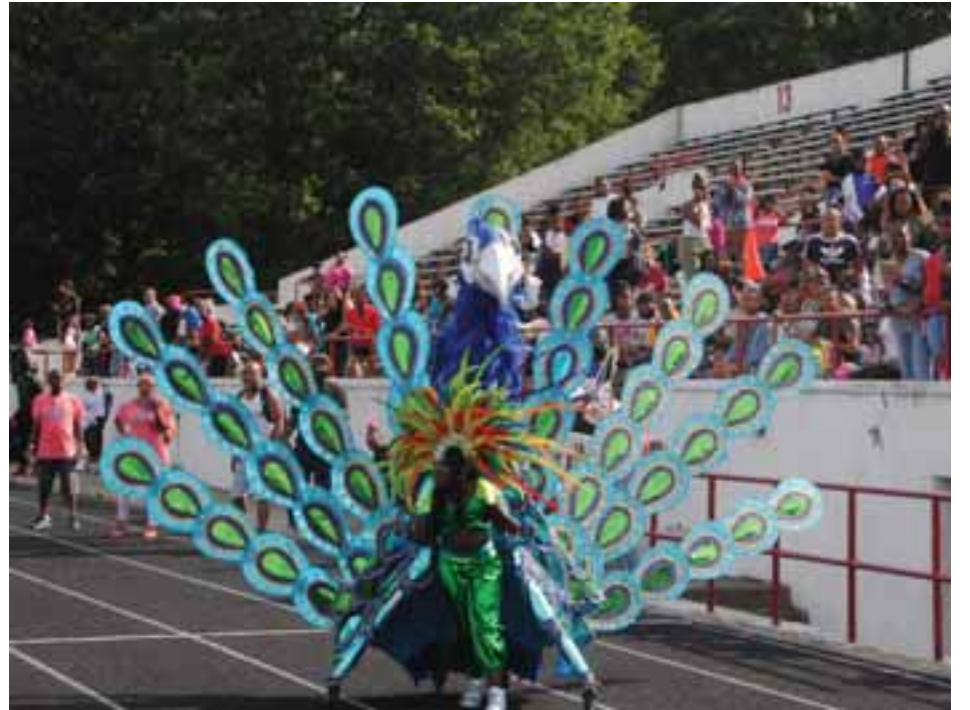
A view of the Kiddies Carnival, which has played in White Stadium every August since 1984.