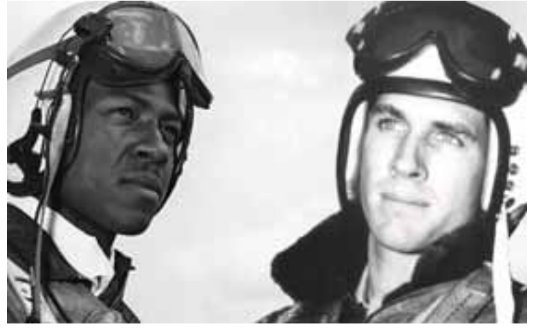
Korean War veterans Jesse Brown, left, and Thomas Hudner, right.

Hudner's wingman on December 4 was Jesse Brown. Both in their twenties, the two could not have been more different. The former was a New Englander who as a graduate of prep school had been invited to Harvard University. Brown, the son of a Mississippi sharecropper, broke the Navy's racial barrier for pilots, just months after President Truman had ordered