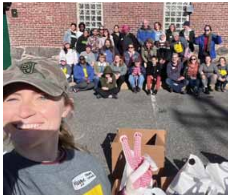
Dozens of volunteers boxed up and delivered 180 boxes of food to the JP neighborhood recently.