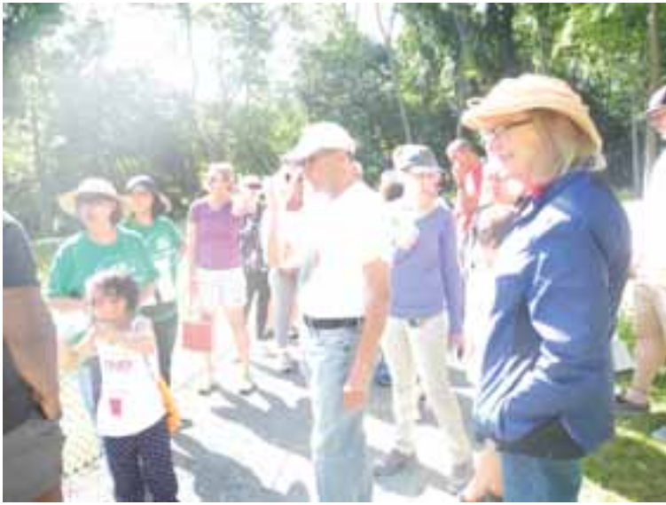
Keep Hyde Park Beautiful held a tour of the Sherrin Woods earlier this week to the delight of a few dozen residents.