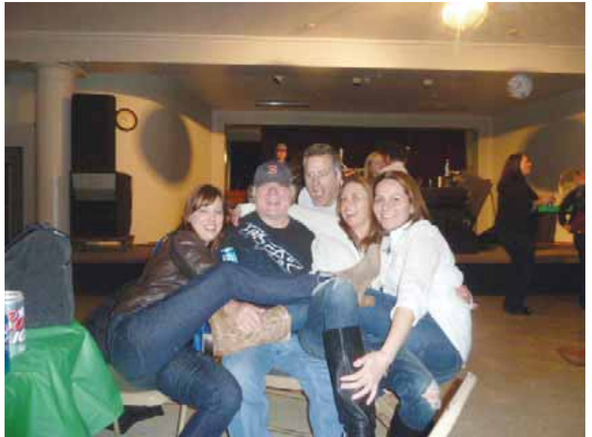
Kiwanians are once again welcoming Jim Plunkett to help raise funds for children's programing in the West Roxbury Roslindale area.