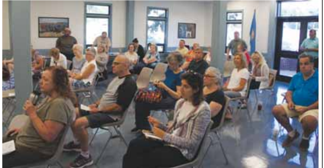
About 50 residents came out on Aug. 9, a Friday morning, to hear about the upcoming plan for a road diet at Centre Street.