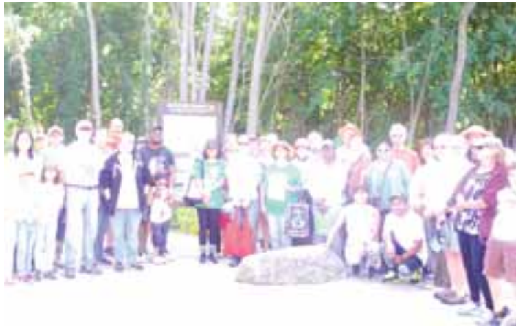
Dozens came out to see the park and lend a hand to clean up a bit of litter there.

The former Boston Natural Areas Network worked with the City and negotiated the sale to