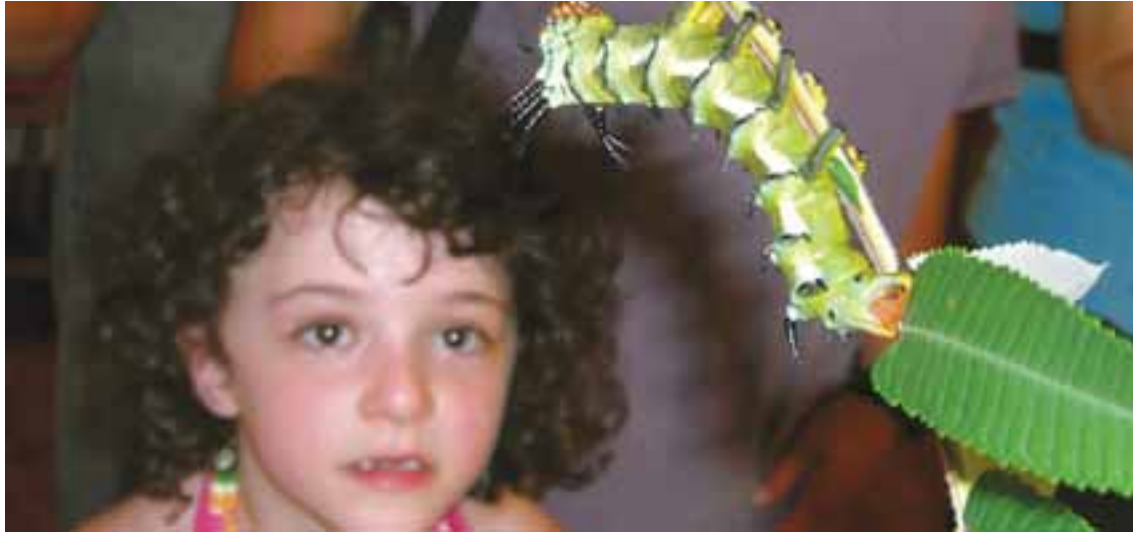
Residents will get a chance to come to the Arboretum for several days next week to see how creatures can live with a couple dozen legs, inside a chrysalis or with wings.