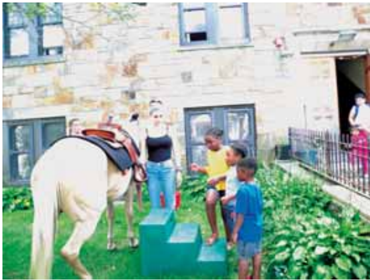
Residents came out to have some fun and get to know each other outside of a Sunday service setting.