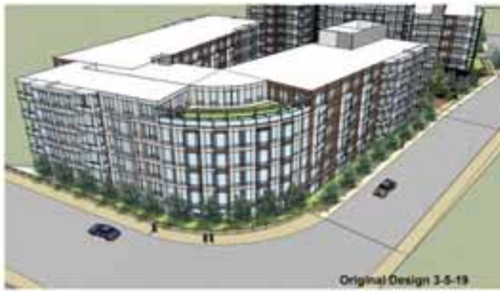
Original Design 3-5-19