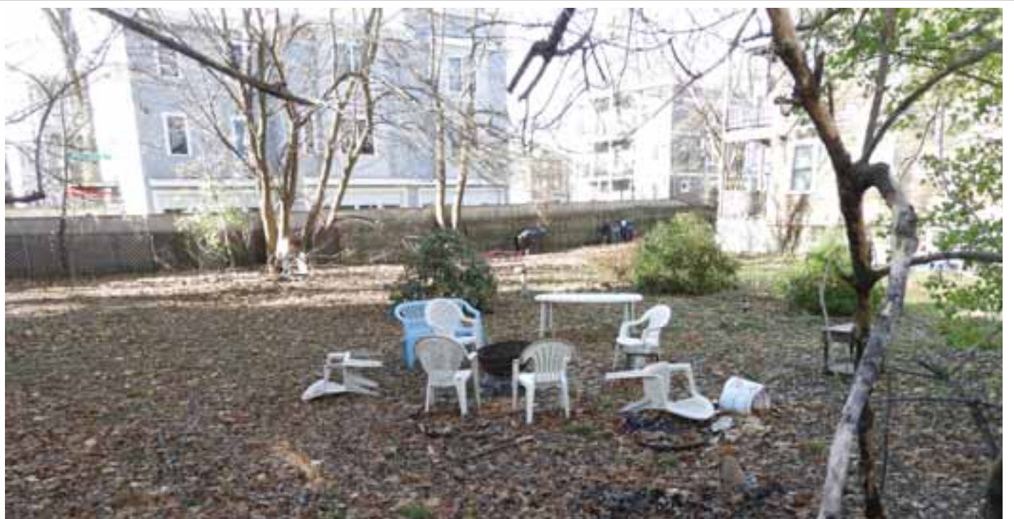
The long vacant lot at 99 Williams St is used as an ad hoc neighborhood park.