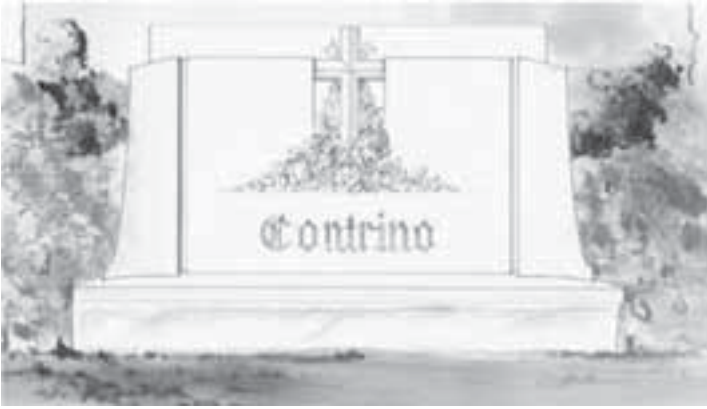
A CENTURY OF SERVICE TO THE COMMUNITY