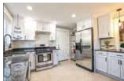
309 WACHUSETTS STREET JAMAICA PLAIN $499,900 Listed by Michelle Quinn