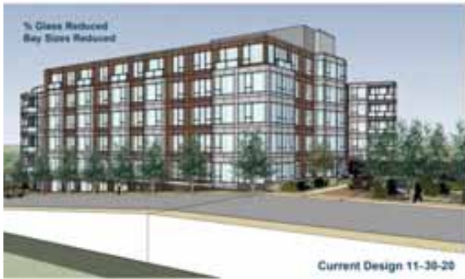
Current Design 11-30-20