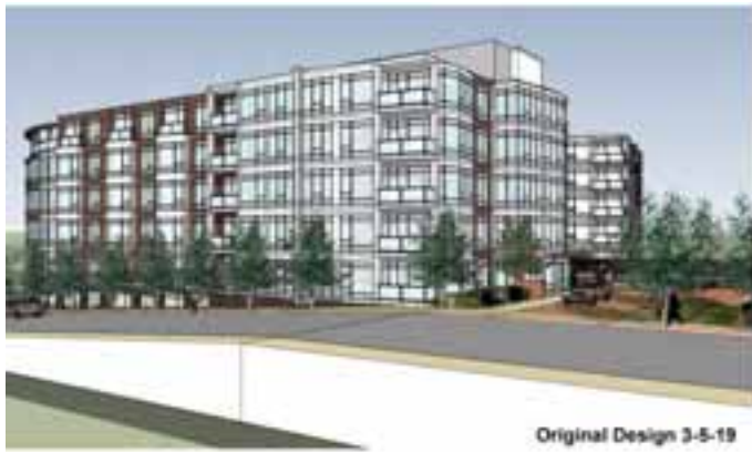
Original Design 3-5-19