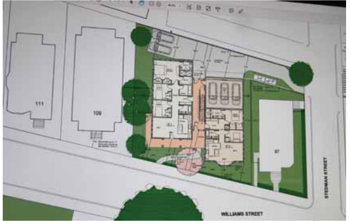
Lot plan showing the two attached three-family houses, their setbacks and parking arrangement off Stedman Street.