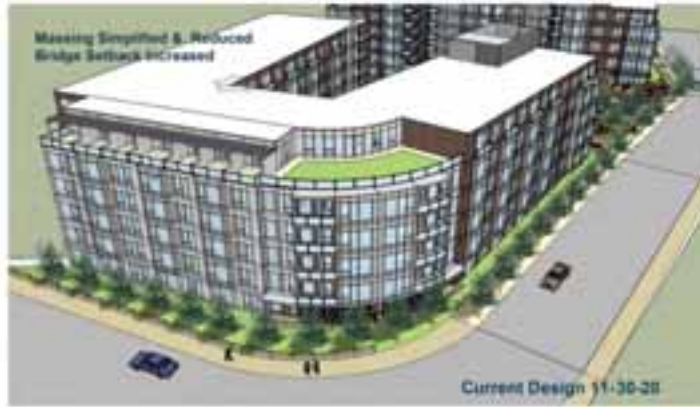
Current Design 11-30-20

The developers for 1717-1725 Hyde Park Ave. have reduced the size of the project and made improvements since the last public meeting, with the former proposal above and the new proposal shown below.