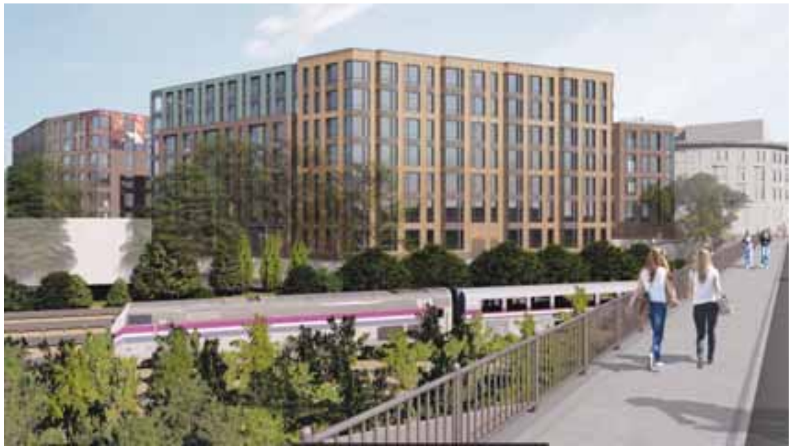
The community benefits package will include a new 20,000 square-foot park that will be privately maintained by the building owner.

The project will likely be coming up at the next BPDA Board meeting,