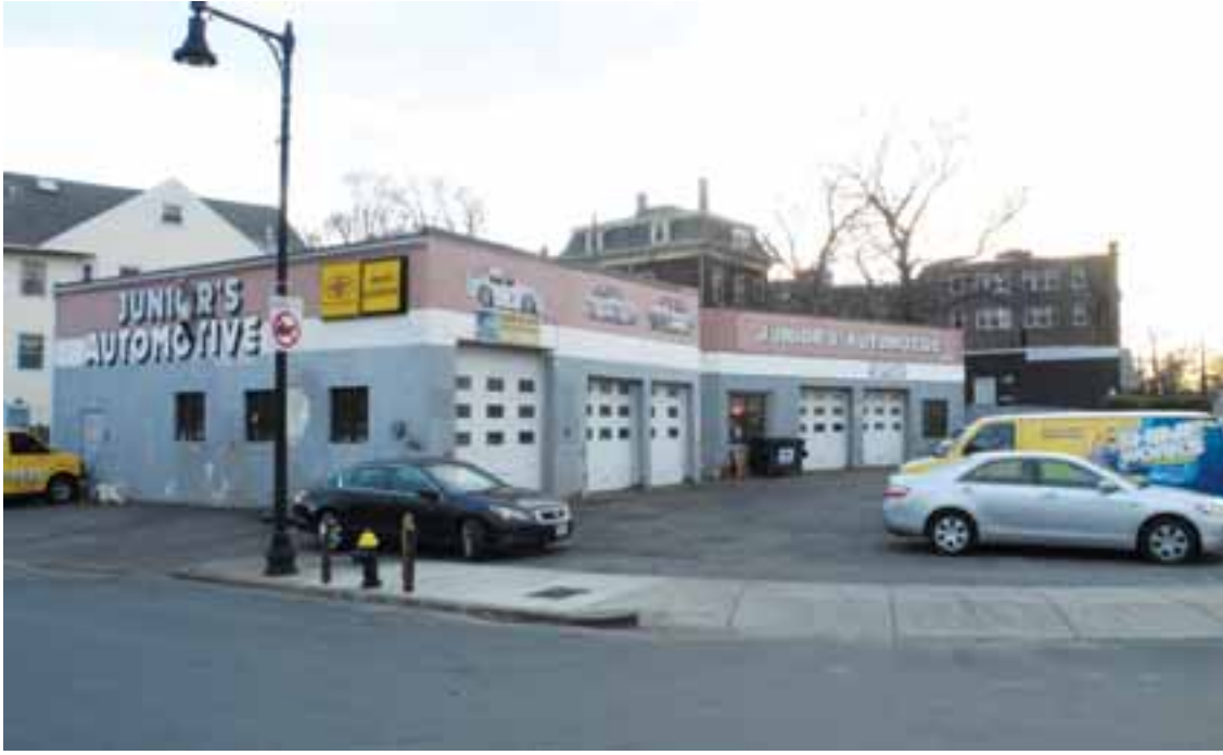
The former site of Junior's Automotive. Developers are proposing to put up retail and transit-oriented residential units at the former garage.