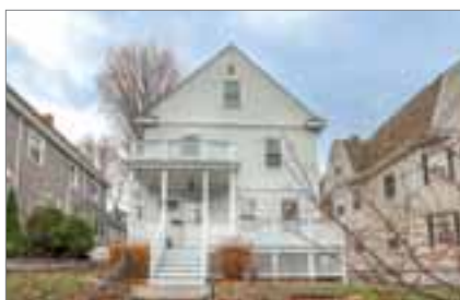
39 BRADWOOD STREET ROSLINDALE $749,000 Listed by Steve Musto