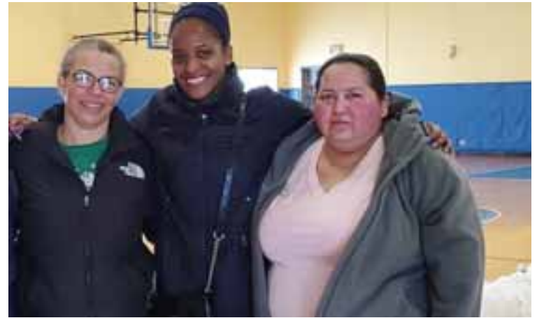
Roslindale Food Pantry organizers are working hard to keep Archdale fed and healthy.