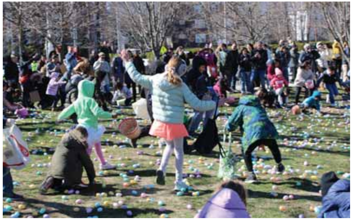
The hunt itself only lasted a few minutes, but residents hung out after to catch up and enjoy the spring weather in Brighton over the weekend.

Caddell appreciated the personal touch of the event. Back home, he said, wealthier towns fly a helicopter overhead to