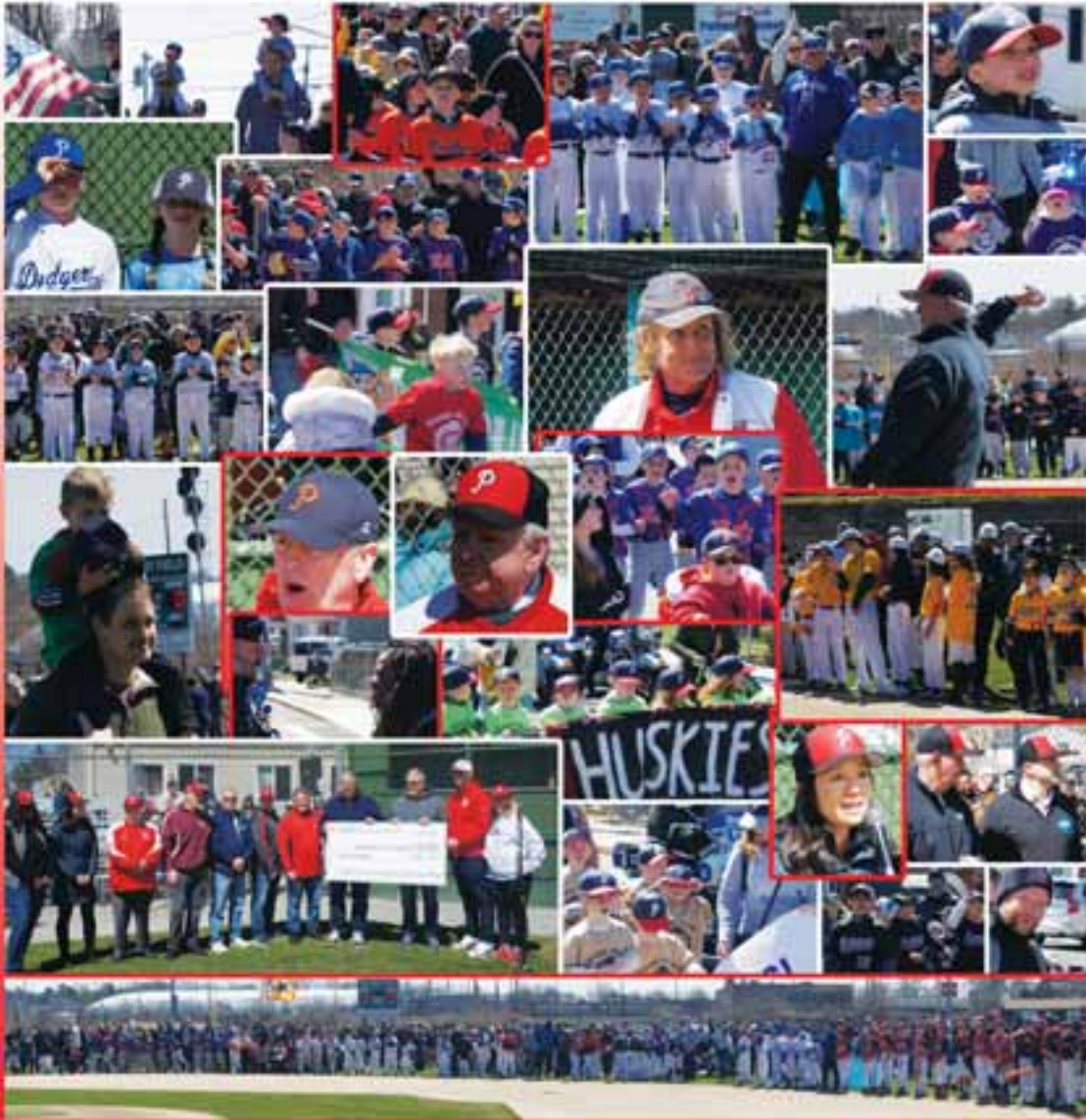
Thousands came out to open the season for the Parkway Little League and raise funds for the rehabilitation of Bunker Field off Baker Street.