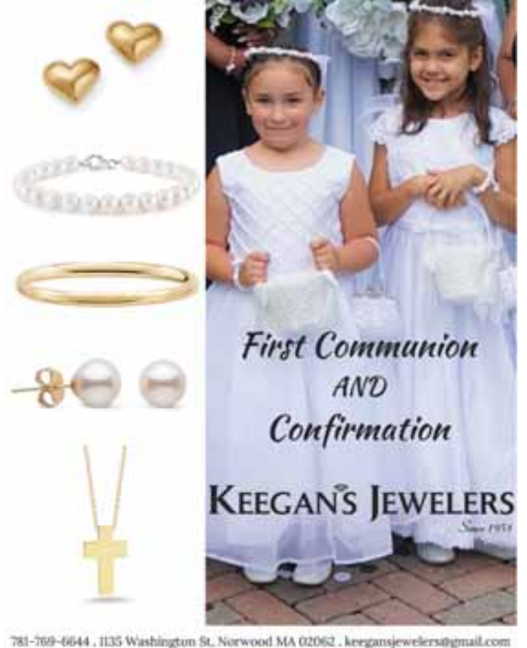
781-769-6644 . 1135 Washington St. Norwood MA 02062 . keegansjewelers@gmail.com