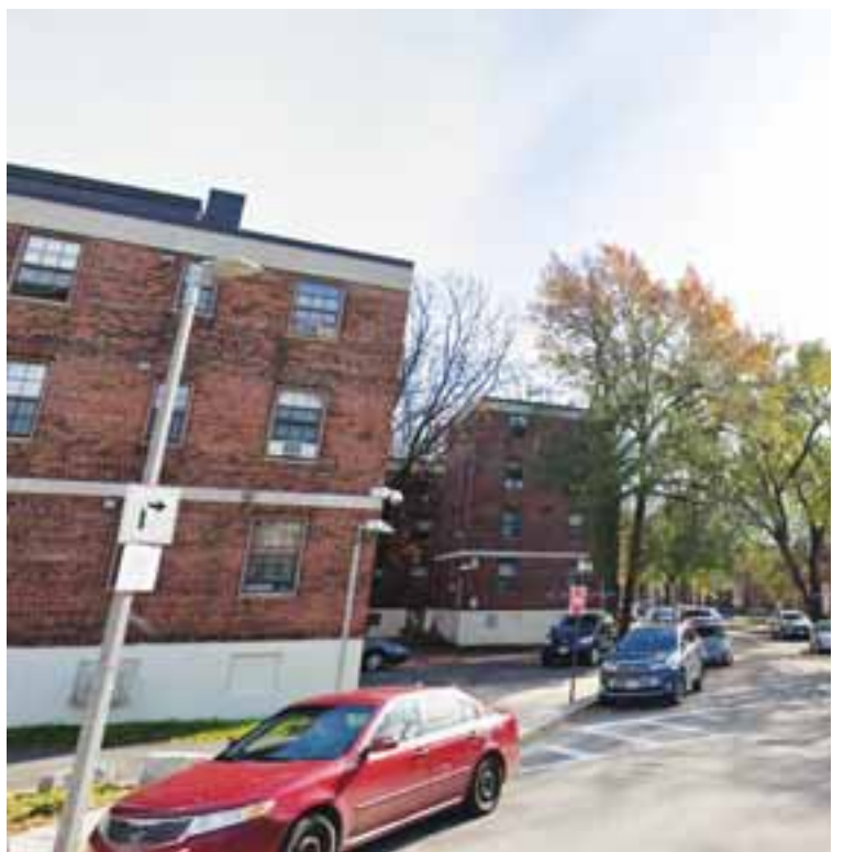
The City Council will be taking stock of the Boston Housing Authority's buildings in the coming months after a death at the McCormack complex in South Boston.