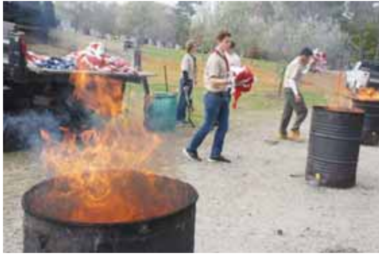
Scouts dispose of hundreds of flags on Veterans Day, showing them the proper respect the U.S. Flag Code requires.

“The Scouts read through excerpts from the flag code, they’ll talk about the flag itself and they might learn something and then putting them in the barrels is always fun for the Scouts,” he said. “It’s nice to ultimately do a