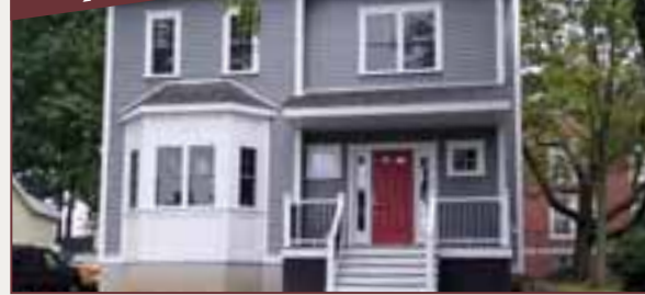
HYDE PARK Great opportunity for perfection. Absolutely beautiful home in desirable Sunnyside Neighborhood. 4 bedrooms 2.5 baths. Mint and Marvelous. Just what you want with everything you need! Offered at $819,000. Call now for details and first showings!