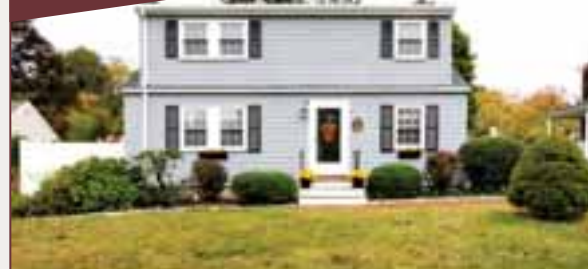
Expanded Cape at the top of the hill. Updates Galore. FP Livingroom, modern ‘open concept’ Kitchen and Dining, 3+ bedrooms, 2 baths. Finished lower level, fabulous first floor den and adjoining patio. $622,000

CALL FOR AN OPINION OF VALUE... WE HAVE CUSTOMERS GALORE!