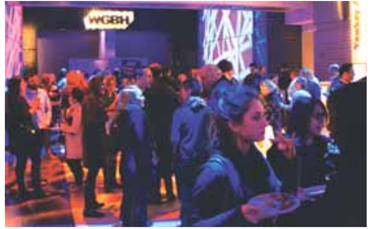
The Allston Brighton Community Development Corporation hosted its annual All Bright Night at the WGBH Studios on Tuesday to celebrate its accomplishments in keeping Allston Brighton affordable.

“I didn’t grow up here but I’ve lived here 30 years,” she said, noting that that made her a newcomer in the neighborhood. “I have been kind of fighting for win-win situations when it comes to development, and now it’s just exploding, but the nonprofit CDC is a developer who tries to sup-