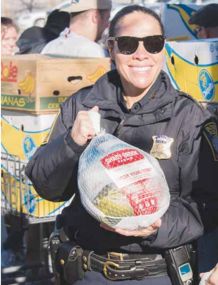
Families in Need is coming back to the Parkway to help residents who might need a helping hand this holiday season.