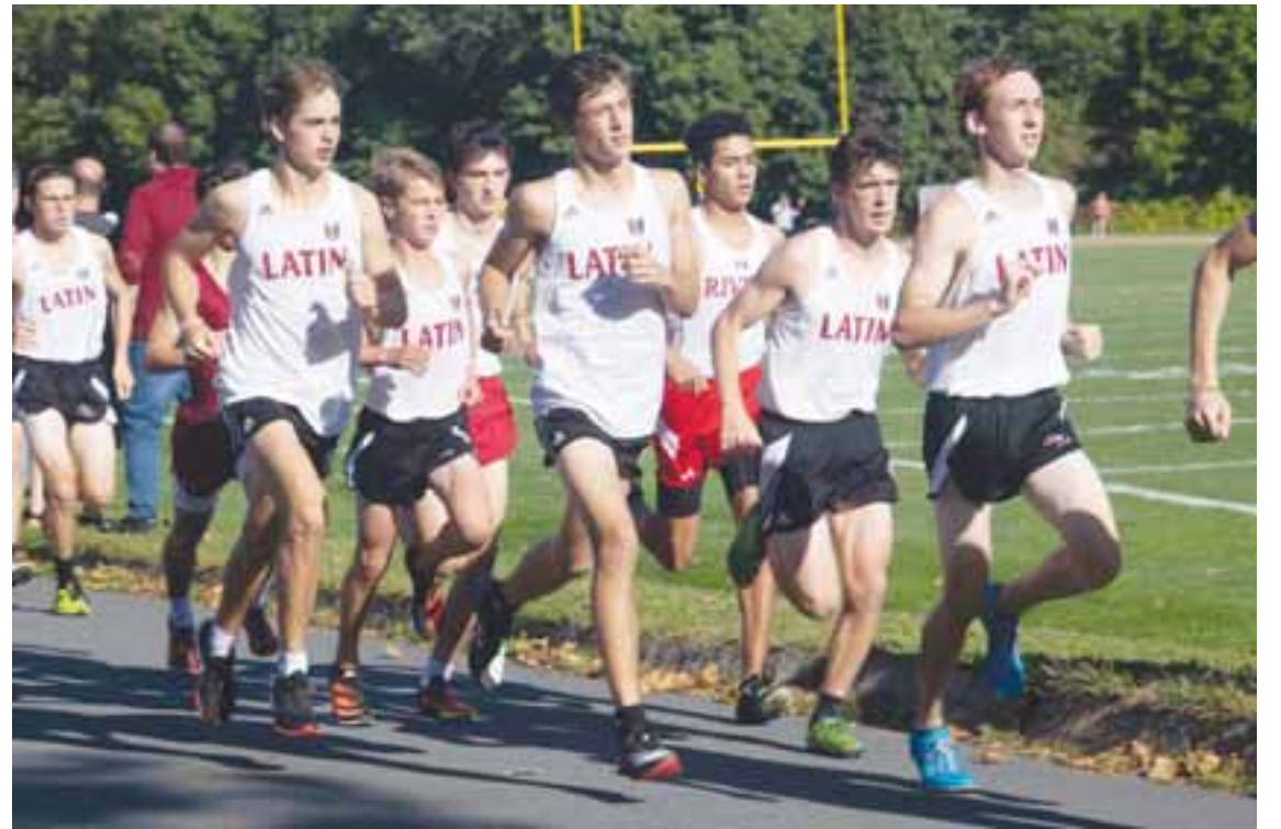
Roxbury Latin's varsity cross country team are the 2019 Independent School League Champions. This is the team's second ISL title in three years. The team placed second in the New England Championships on November 9, ceding a title they've held for two years. Five Roxbury Latin runners earned All-NEPSAC distinction.