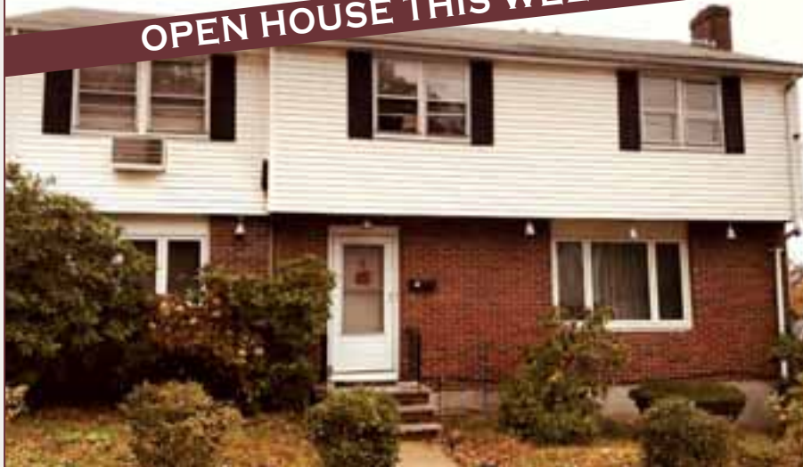
Fairmount Hill 8 room 4 bedroom with master 2.5 baths First Floor Family room. Finished basement, all this plus an in-ground pool. $624,900