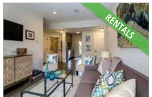
1582 RIVER STREET HYDE PARK 1 BR $2,025 / 2 BR $2,250 Listed by Sue B + Kris M