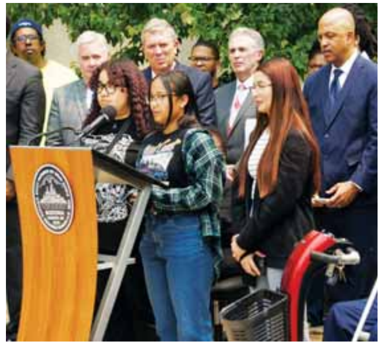
About 80 residents, teachers, officials and alumni came out to the site of the O'Bryant School for the announcement of its move.