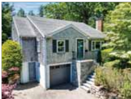
15 NORMAN STREET MILTON

YOUR EXPERT REAL ESTATE TEAM FOR BUYING OR SELLING IN AND AROUND THE BOSTON AREA!