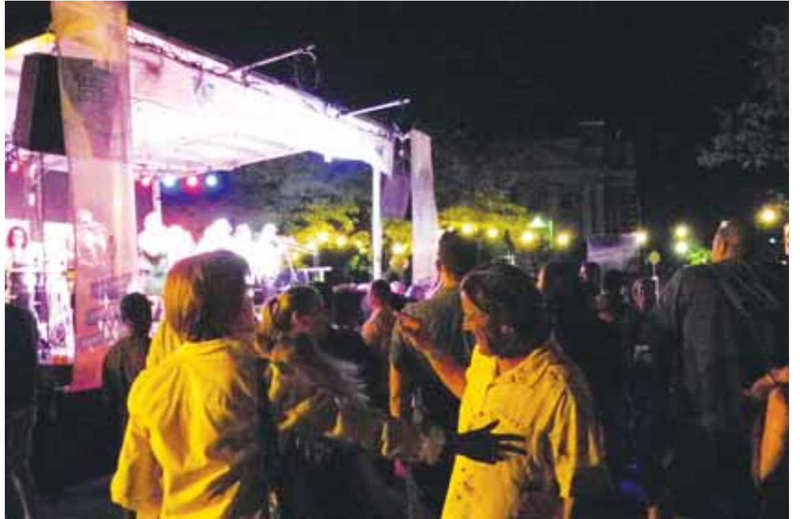
Residents will be recreating the Hyde Park Street Festival from the 150th anniversary of Hyde Park, and organizers say they want to make it an annual event.

2030 Centre Street, West Roxbury, MA 617-469-4177 • WWW.CORRIBPUB.COM