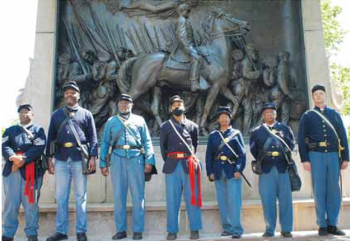
Members of the 54th Regiment of Massachusetts Volunteers Company A marched out to the Boston Common recently to reenact the regiment shipping out to fight in the south.