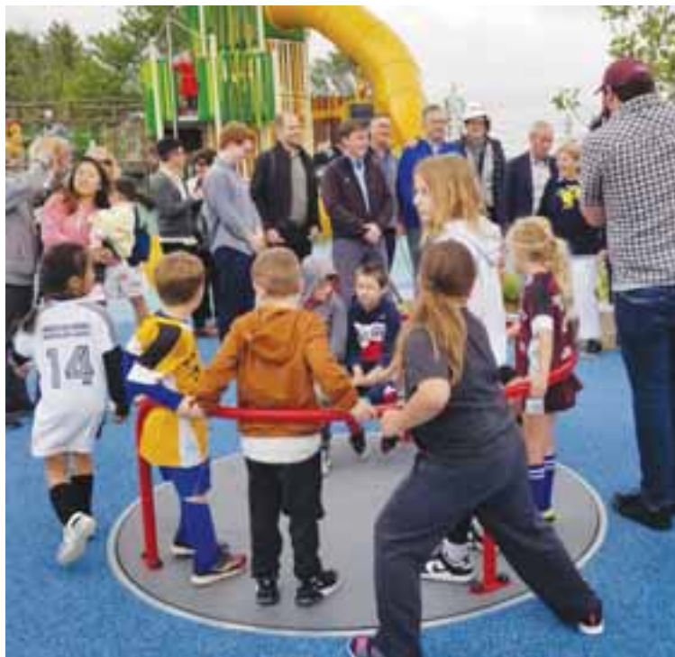
The new space at Millennium Park will give more reasons to head down to the VFW.