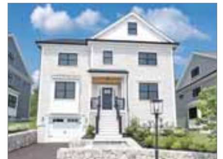
5 STARLING STREET WEST ROXBURY

SINGLE FAMILY 4 beds; 2 full, 1 half baths $1,250,000 Listed by Linda Burnett