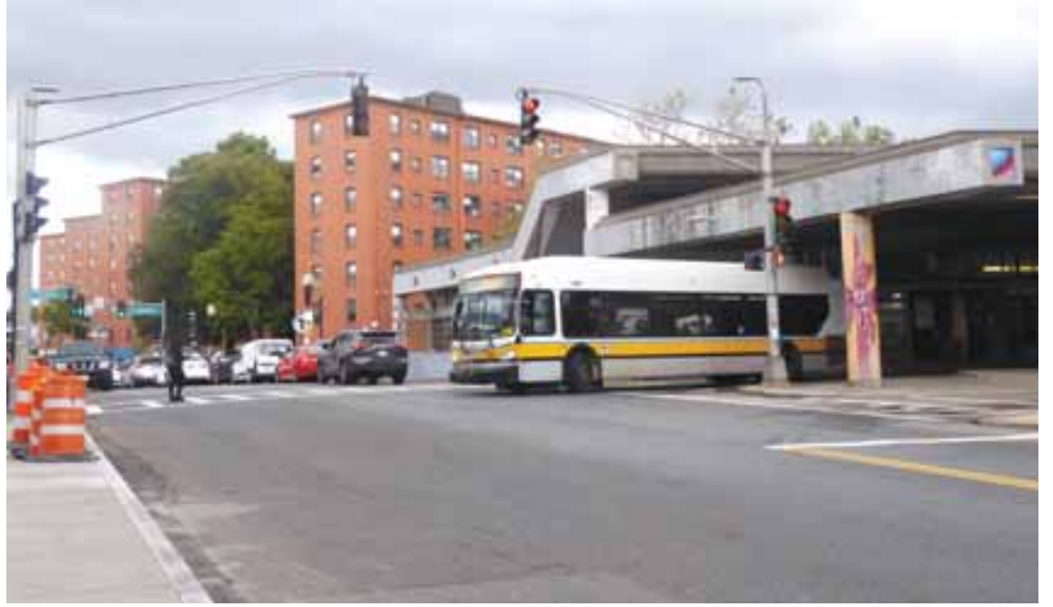
To help cut down on wait times, four bus routes now travel only in way lanes at Jackson Square