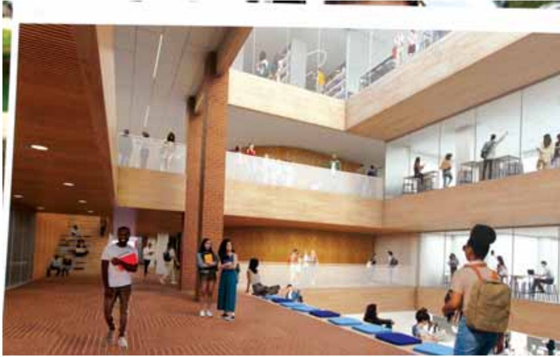
The new West Roxbury Educational Complex will have an open floor plan that, as the rendering shows, would allow a lot of natural light into the building.