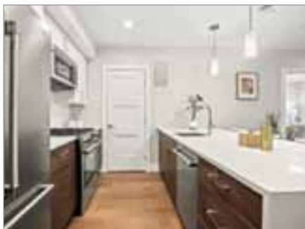
425 LAGRANGE STREET U:104 WEST ROXBURY

SINGLE FAMILY 4 beds; 2 full, 1 half baths $1,650,000 Listed by Kris MacDonald