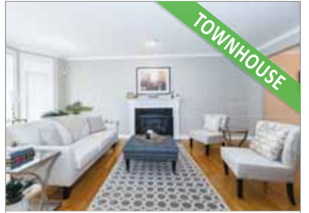
947 LAGRANGE STREET WEST ROXBURY $749,900