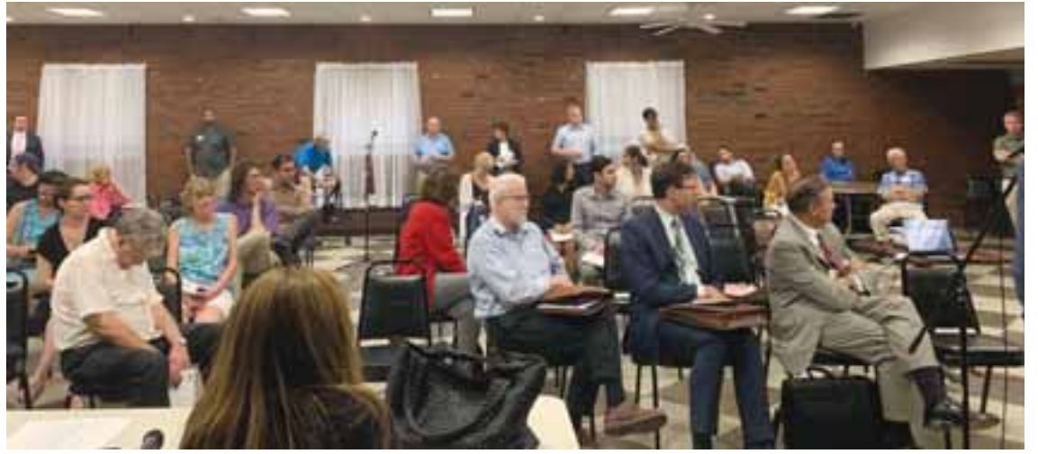
About 40 residents came to the weekly meeting of the Brighton Allston Improvement Association to speak their minds about the 1515 Comm. Ave. proposal.

The proposal also includes 40,000sf of outdoor space at the ground level, approximately 43 percent of the site area. The project planners want to use this outdoor space to incorporate a front yard area that will add "lushness and greenspace" to the city. They also hope to add seating and flexible open space where people can gather. Overlook Park is adjacent to the project site, so the developers hope to create "connectivity" to the park, making access points