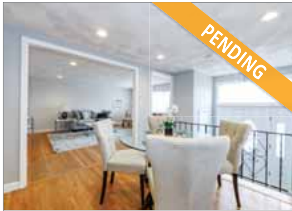
62 LODGEHILL ROAD HYDE PARK $469,000