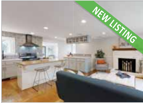
107 LAURIE AVENUE WEST ROXBURY $659,000