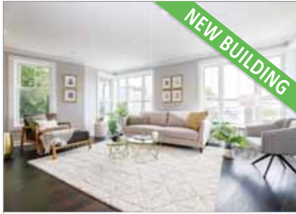
1789 CENTRE STREET WEST ROXBURY FROM $699,000