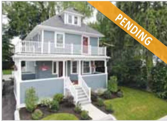
554 WELD STREET WEST ROXBURY $949,000