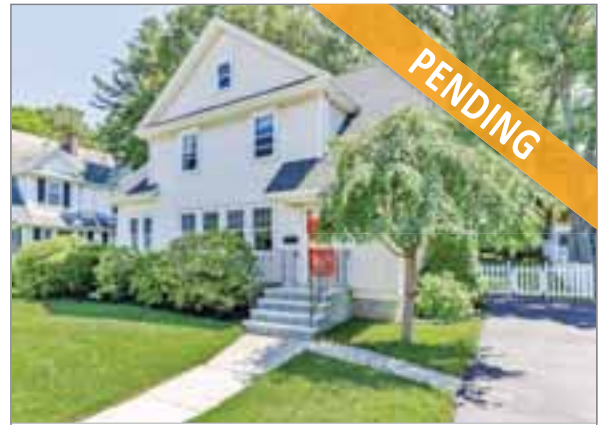
30 GLENBURNIE ROAD WEST ROXBURY $749,000