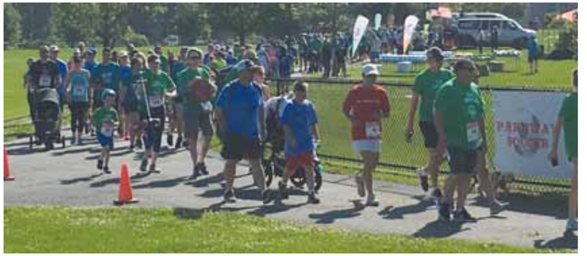
Hundreds came out for the race in West Roxbury. Luckily the weather was cooperative.