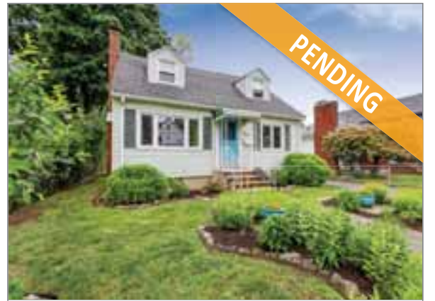
14 CLEVELAND STREET 2 HYDE PARK $449,000