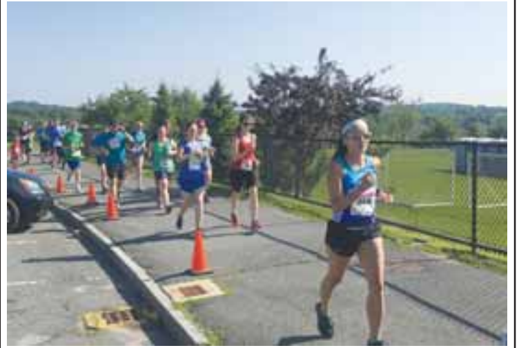
The race was held to raise money for medical programs at the Franciscan Hospital in Brighton.