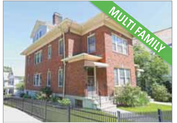
90-92 WALTER STREET ROSLINDALE $849,000