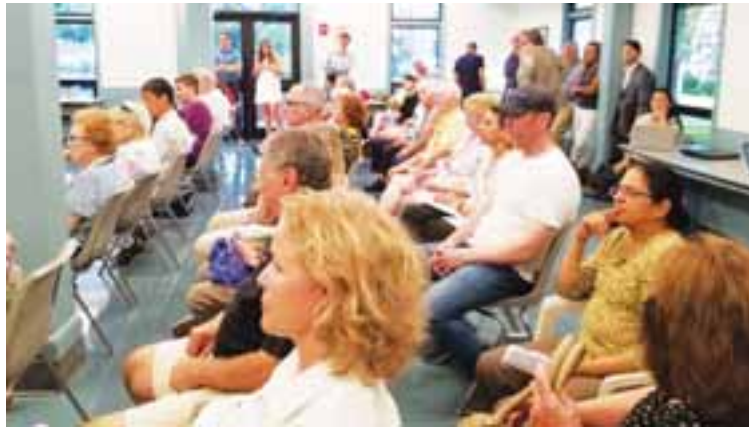
The WRNC Zoning Subcommittee voted to approve the 11 and 26 Heron St. proposals at Tuesday's meeting.