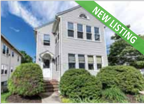
64 WELLSMERE ROAD ROSLINDALE $449,000