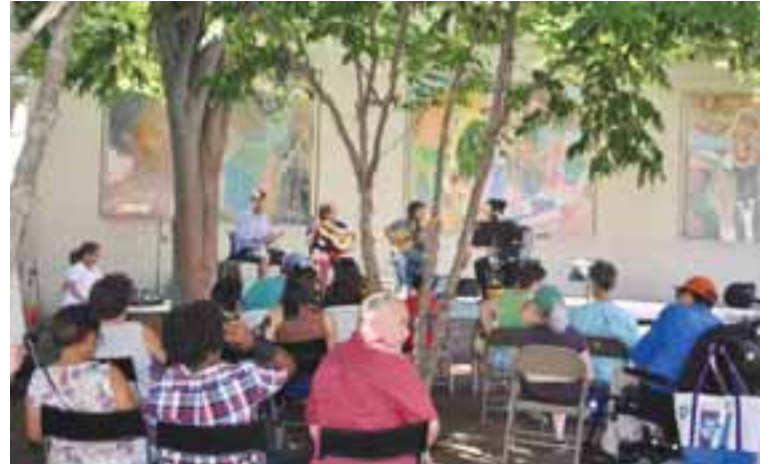
Porch Fest Concert at the Peace Garden in July 2018