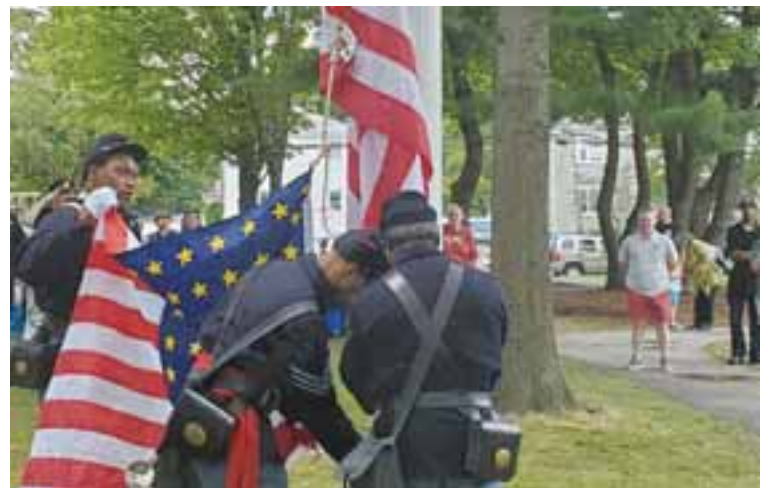
Members of the 54th added the Civil War-era flag on Saturday as part of a rededication to the park and to honor those who trained there.