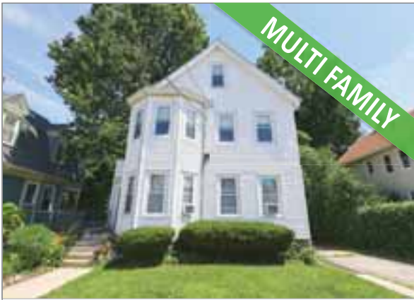
87 HEWLETT STREET ROSLINDALE $849,000