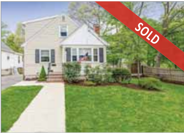
10 ALTA CREST ROAD WEST ROXBURY $599,900