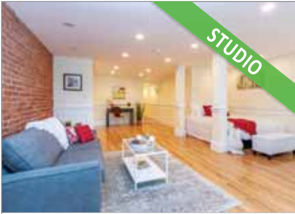
382 RIVERWAY MISSION HILL $389,000