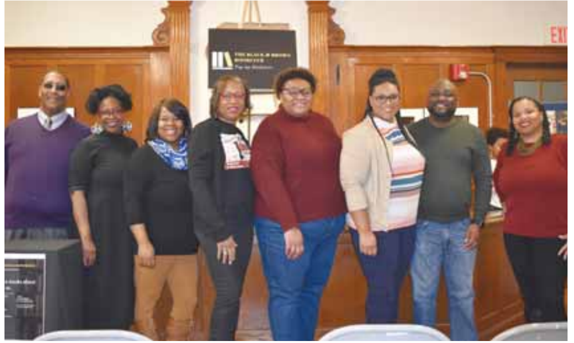
The first meeting of the Black and Brown Bookclub of Boston took place recently in Hyde Park at the Menino Arts Center.