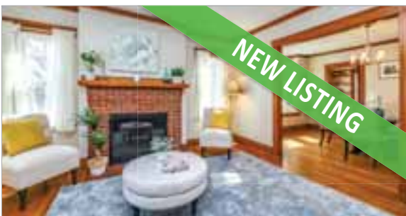
506 LAGRANGE STREET WEST ROXBURY $829,900 Listed by Lisa Sullivan