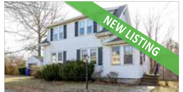
43 GUILFORD ROAD MILTON $499,000 Listed by Michael Hunt