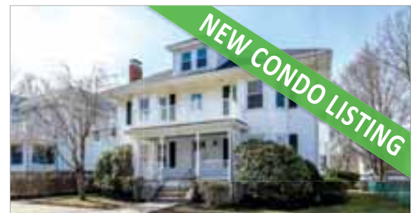
9 ORIOLE STREET WEST ROXBURY $535,000/$555,000 Listed by Sue Brideau