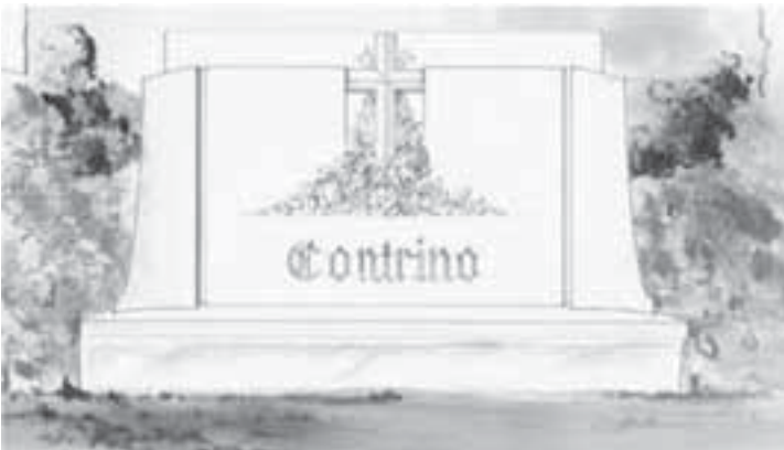
A CENTURY OF SERVICE TO THE COMMUNITY