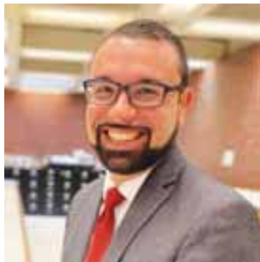
District 5 City Councilor Ricardo Arroyo

District 5 City Councilor Ricardo Arroyo called for a hearing during the regular Boston City Council meeting to determine how racism could be more effectively combated if the city labeled it as a public health emergency.