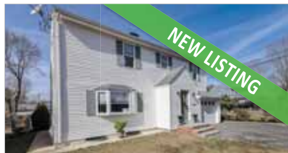
14 MAPLE TERRACE WEST ROXBURY $849,000 Listed by Mary Forde