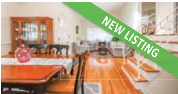
46 ALPHEUS ROAD ROSLINDALE $499,000 Listed by Helen Gaughran