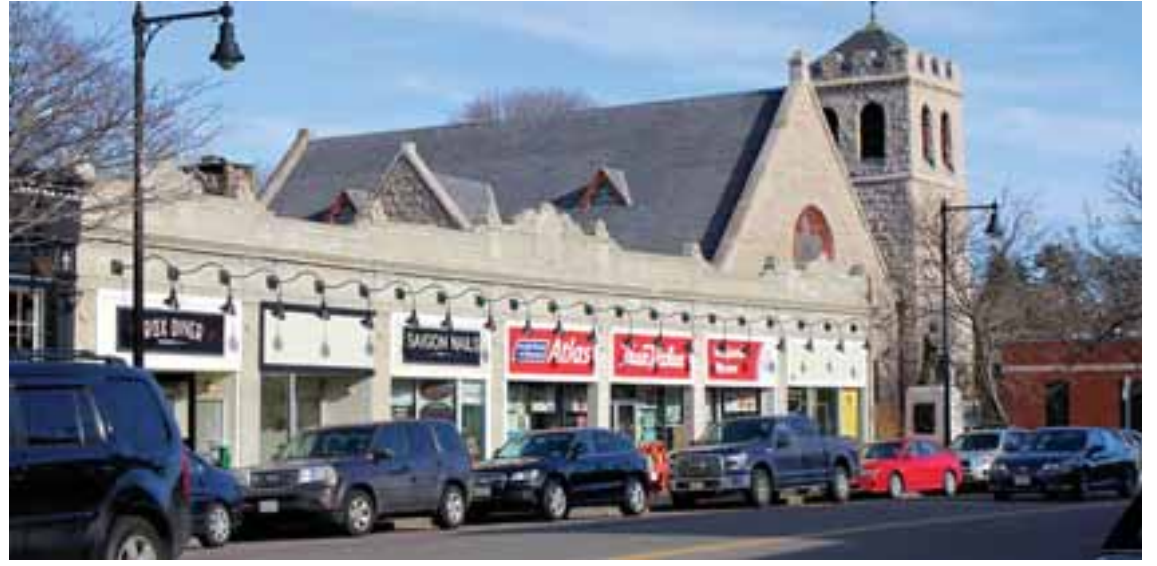
Businesses all around the neighborhood are being affected differently based on the type of business they do.