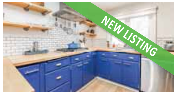
29 DENTON TERRACE ROSLINDALE $649,000 Listed by Steve Musto