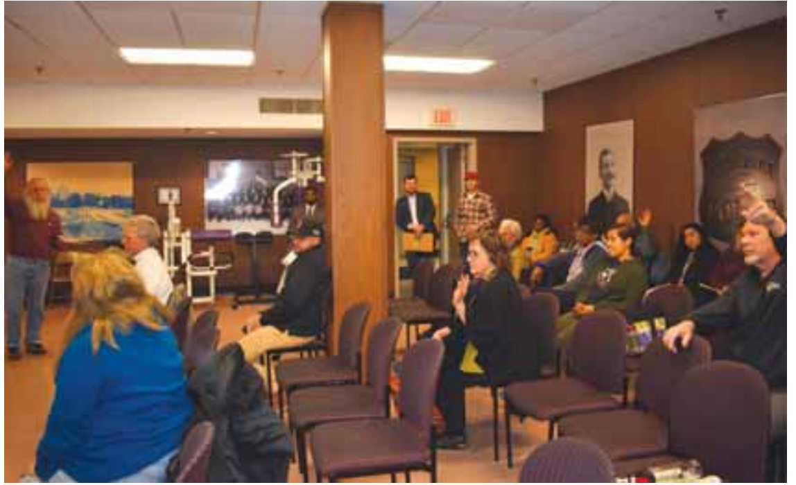
Recently, the Hyde Park Neighborhood Association updated the community of the continuing debate over the proposed project at 11 Dana Ave.

One of the main contentions of the 11 Dana Ave. proposal is what the plans say is a basement. A basement must be more than 35 percent below grade, but the area is only four feet below grade. The HPNA asserts it is technically part of the first floor. First-floor parking is forbidden in a Neighborhood Shopping-2 district (NS-2). In