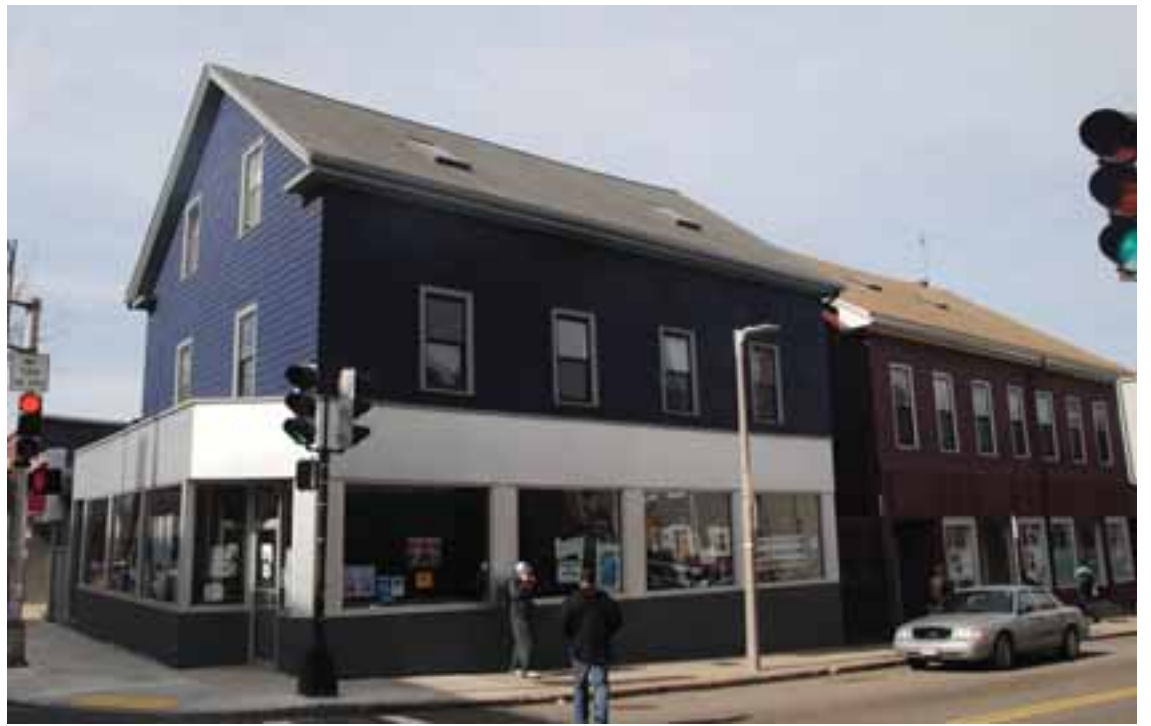
3353 Washington St./211 Green Street will remain standing for two more years as BCV received an extension on its development of the property.