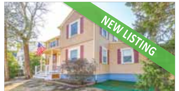
73 HAMILTON STREET READVILLE $734,900 Listed by Pat + Judy