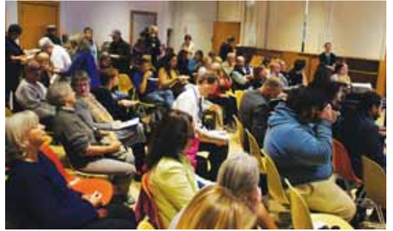
About 100 residents came out to hear what the BPL has planned for the Roslindale Branch Library.

Friends of the Roslindale Library members asked that the designers look into possibly having an office space in