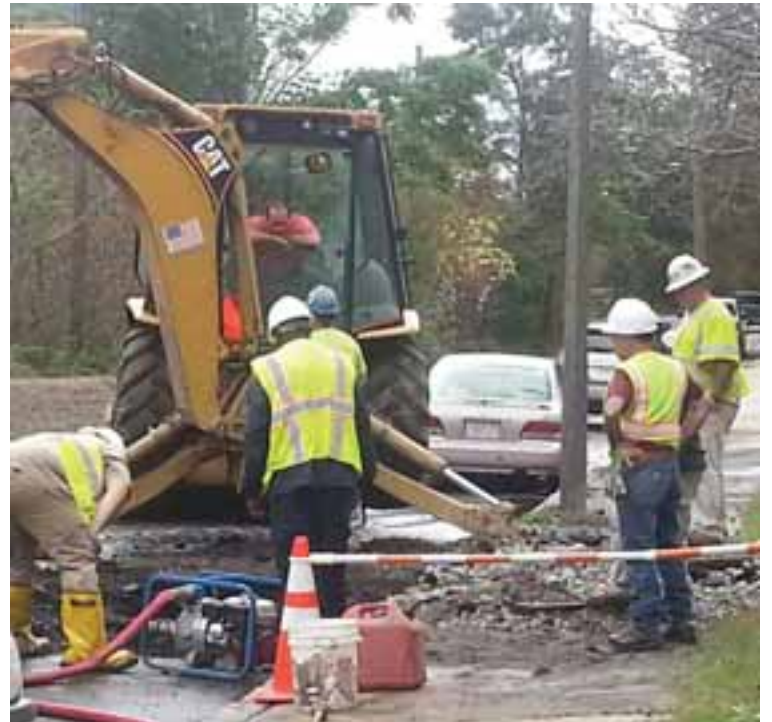
A water main burst on Sunday at 1 Cliffmont St. and the area was without water service for seven hours.