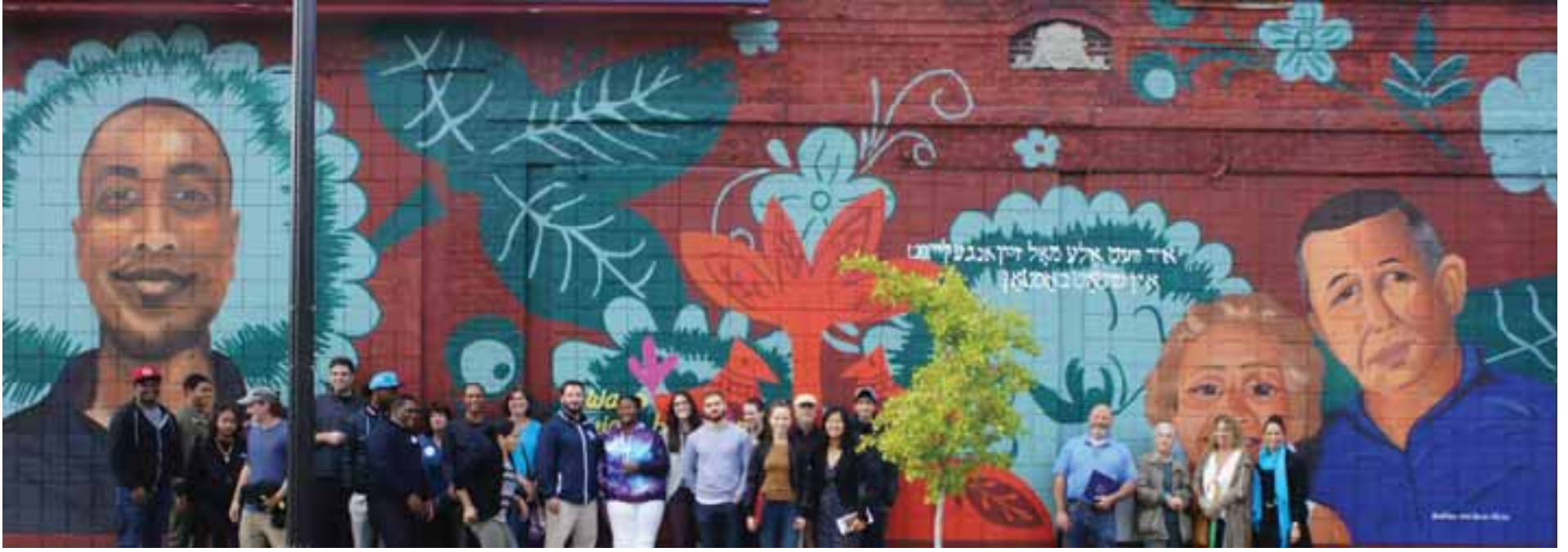
Dozens of residents came out for the official unveiling of the To Immigrants with Love Mural on Atlas Liquors in Roslindale.