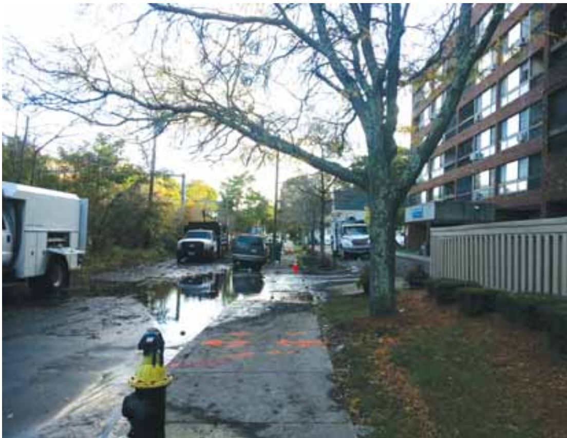
Services returned after seven hours of no water at the apartment complex. Residents reported seeing plumes of water shoot out of the street.