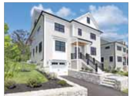
5 STARLING STREET WEST ROXBURY

SINGLE FAMILY 4 beds; 3 full baths $1,199,000 Listed by Lisa Sullivan