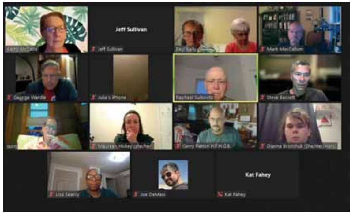
The Longfellow Area Neighborhood Association met recently and discussed several changes coming to the neighborhood.