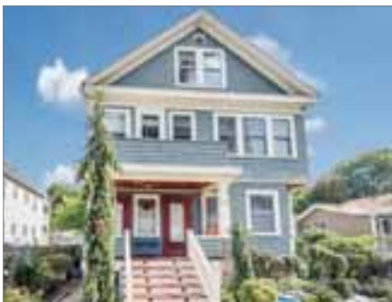
87 DENT STREET, U:87 WEST ROXBURY

YOUR EXPERT REAL ESTATE TEAM FOR BUYING OR SELLING IN AND AROUND THE BOSTON AREA!