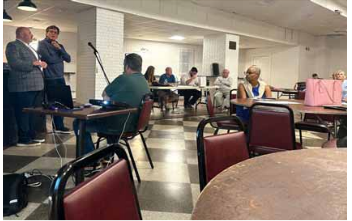
The Brighton Allston Improvement Association met and discussed several development proposals around the community.

“You guys seem like you have to max it out all the time, leave no stone unturned,” said one resident. “These buildings are massive! Again, it seems as though you leave no stone