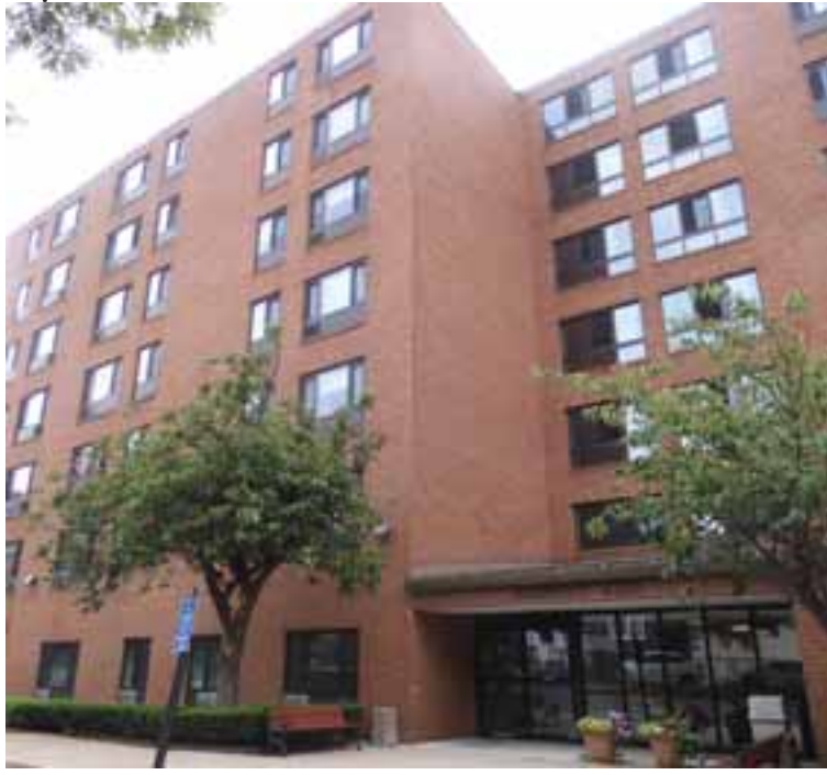
The Farnsworth House at South Street and Carolina Avenue in Jamaica Plain.