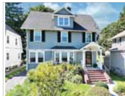
287 STRATFORD STREET WEST ROXBURY

CONDO 2 beds; 1 full, 1 half baths $2,250,000 Listed by Kris & Mike