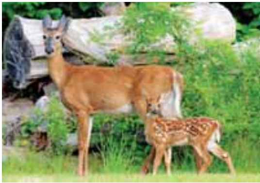
Mother and Baby Deer