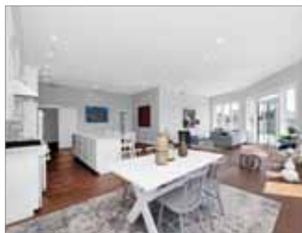
480 WEST BROADWAY, U:402 SOUTH BOSTON

CONDO 2 beds; 1 full, 1 half baths $800,000 Listed by Kris & Mike