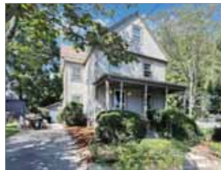
21 BORDER STREET DEDHAM

CONDO 2 beds; 2 full baths $625,000 Listed by Mike & Kris