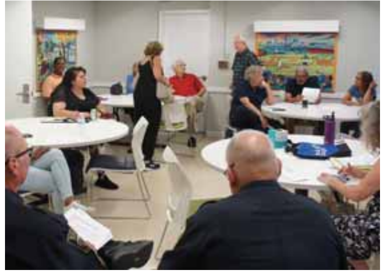
The Mount Hope Canterbury Neighborhood Association discussed the parking lot parties and racing in the neighborhood last week.

“And I think the coach would agree to that as well,” she said.