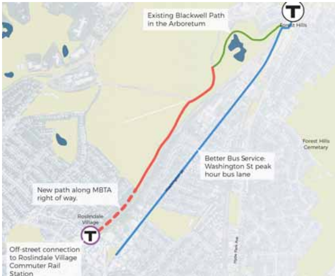
The proposed Arboretum Gateway Project from Forest Hills to Roslindale Village is moving along and should be open soon.