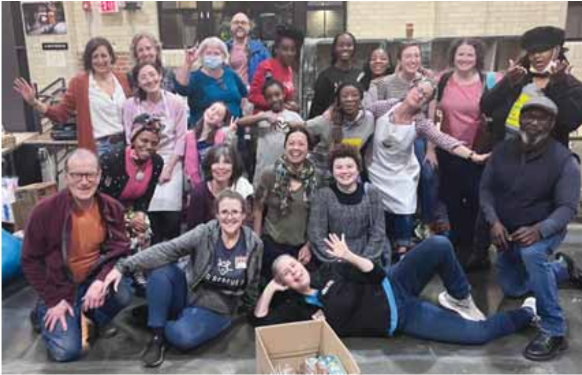
Hundreds of residents came out to support the Empty Bowls Fundraiser at the Roslindale Substation.