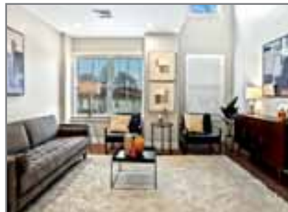
425 LAGRANGE STREET U:205, WEST ROXBURY

Single Family 4 beds, 2 full, 1 half baths $1,700,000 Listed by Kris MacDonald