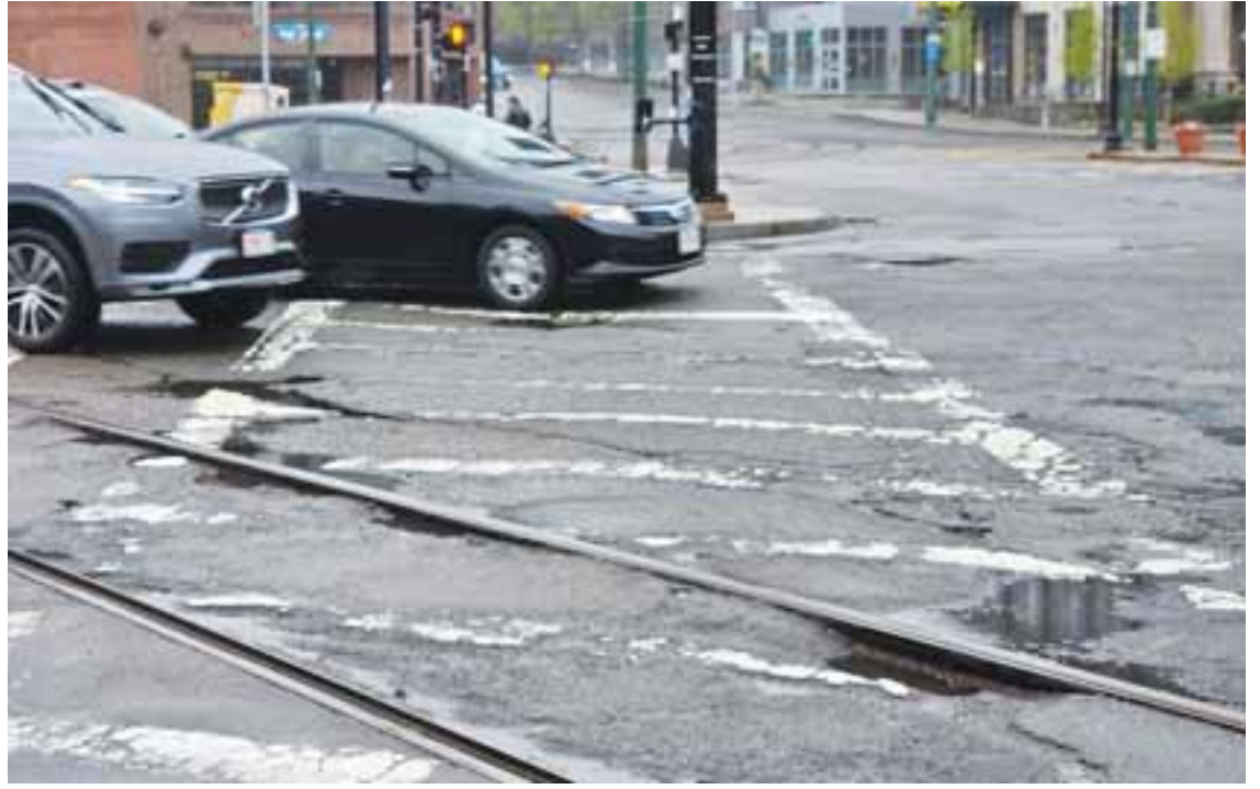
Residents discussed many problem areas for accessibility in the neighborhood, including this example of some seriously difficult conditions at Cleveland Circle.