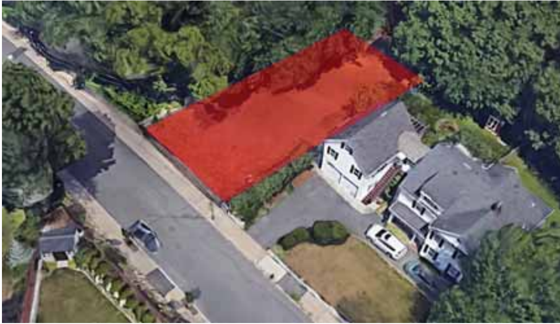
The site of the proposed four units at 68 Rowe St. in Roslindale.