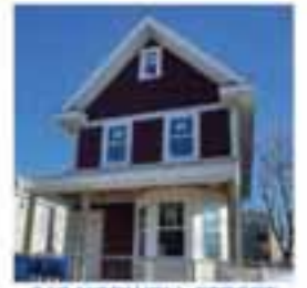
242 NORWELL STREET