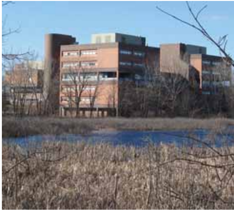
The West Roxbury Educational Complex is slated for a rebuild in the next few years.

The city will also be spending $500,000 for window, boiler,