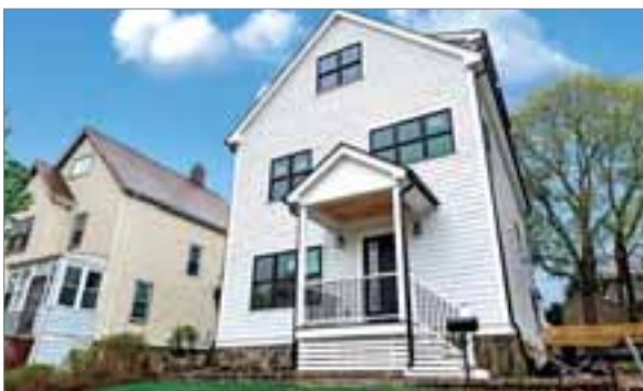
16 COTTON STREET ROSLINDALE

SF $1,299,000 5 beds, 3 full, 1 half baths Listed by Lisa Sullivan