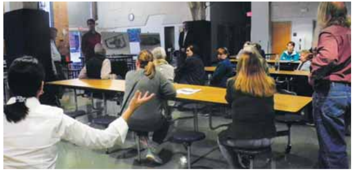
A resident gestures to make a point about 1717-1725 Hyde Park Ave. at the Readville meeting on the project recently in April.

Underlying all of it was the reason the change was being requested in the first place: Ad Meliora’s inability to obtain fi-