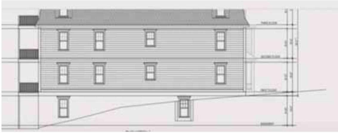
An architect's drawing of the proposed four-unit building on Rowe Street.