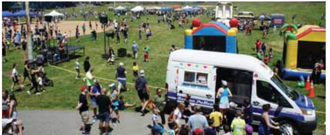
The site of Billings Field, shown here during last year’s Corrib 5K, will see some serious changes in the coming years.

Southwest Boston CDC Assistant Director/Hyde Park resident