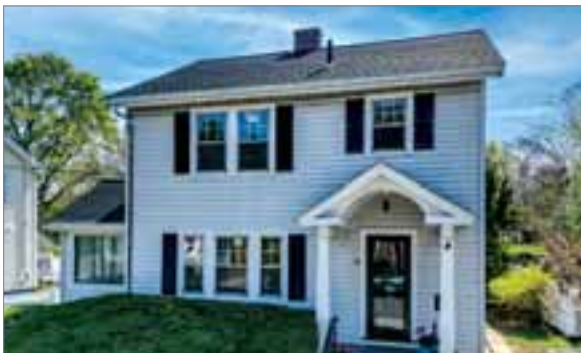
25 BOGANDALE ROAD WEST ROXBURY

YOUR EXPERT REAL ESTATE TEAM FOR BUYING OR SELLING IN AND AROUND THE BOSTON AREA!