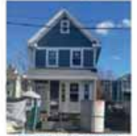
78 SPENCER STREET

BUYER WILL BE SELECTED BY LOTTERY. DEADLINE FOR LOTTERY APPLICATIONS IS MAY 23, 2023.