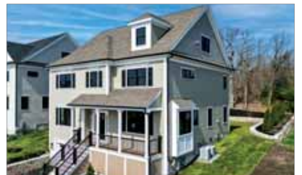
3 STARLING STREET WEST ROXBURY

SF $1,495,000 4 beds, 2 full, 1 half baths Listed by Steven Musto