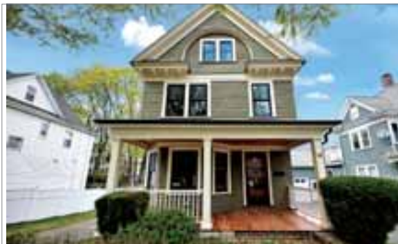
15 ALDRICH STREET ROSLINDALE

SF $749,000 3 beds, 1 full, 0 half baths Listed by Linda Burnett