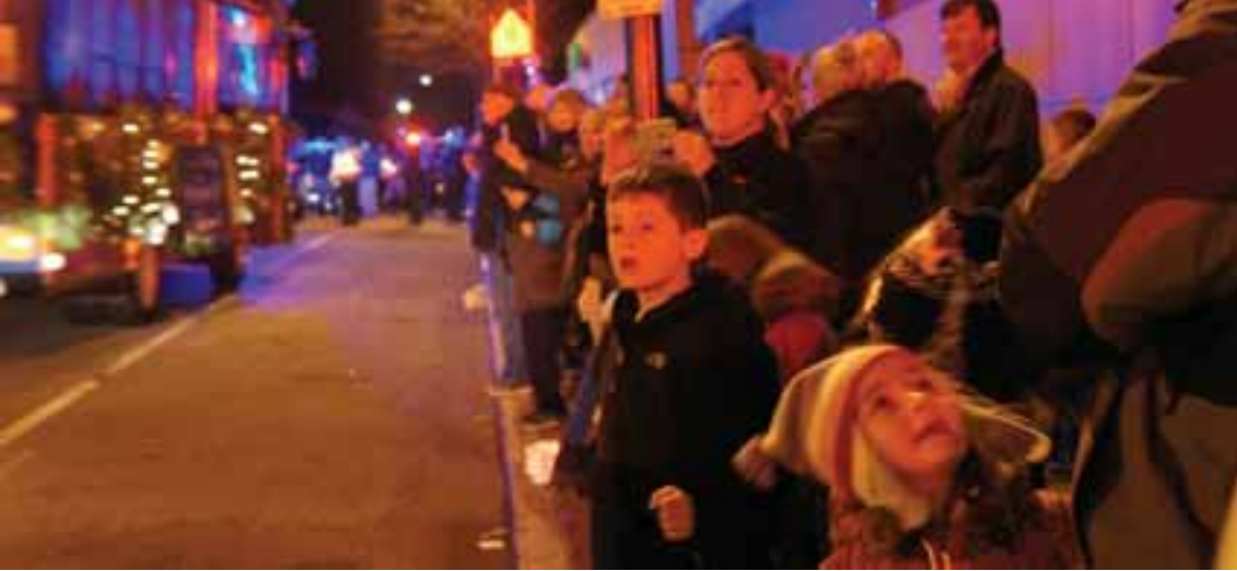
Santa Claus is coming to town, specifically the Parkway. A slew of holiday events are on the docket, sure to send sugar plums dancing.