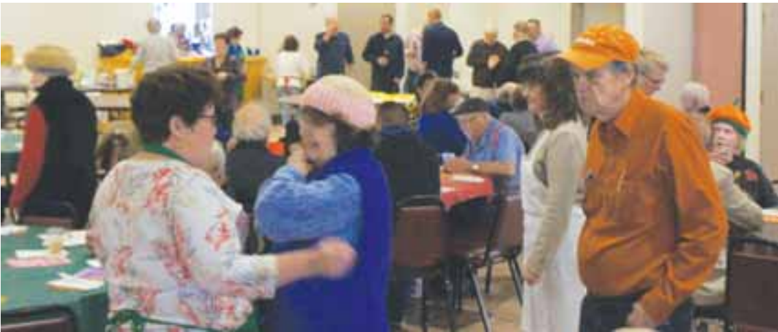
More than 100 visitors came to the Elks in West Roxbury and volunteers delivered more than 300 meals on Thanksgiving all over the city.