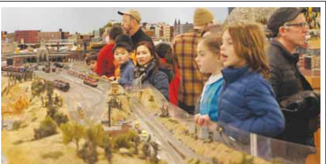
The Bay State Model Railroad Museum in Roslindale will be opening its doors once again this holiday season.

“It’s an improvement over a lot of the proposals we have seen which seem to be densely-packed condo or rental buildings, so this is better over some of the proposals I’ve seen before,” he said.